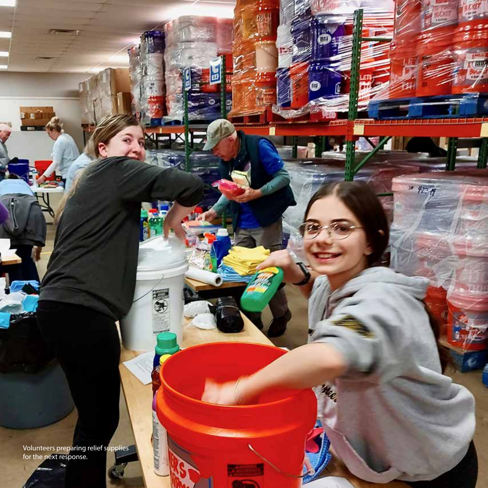
Volunteers preparing relief supplies for the next response.