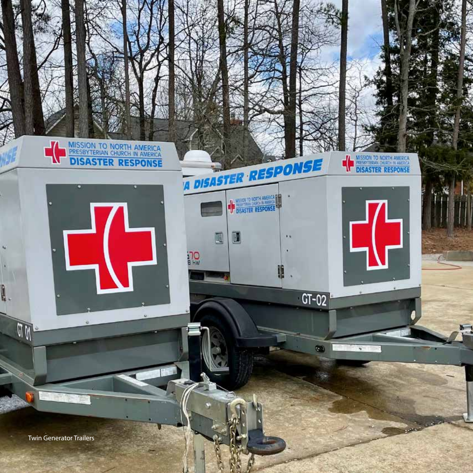
Twin Generator Trailers