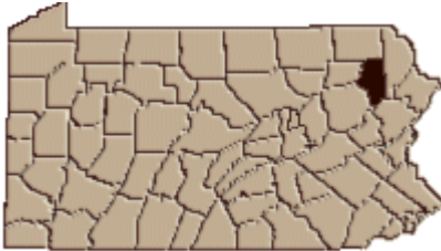
Lackawanna County, PA Scranton

Coal, steel and railroads played huge roles in the development of late 19th and early 20th Century America. Lackawanna County happened to manufacture all three. Residential settlements popped up wherever coal was mined and the economy ran smoothly because there was a need for "black gold", steel and rail ties.