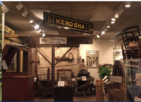
Kenosha History Museum