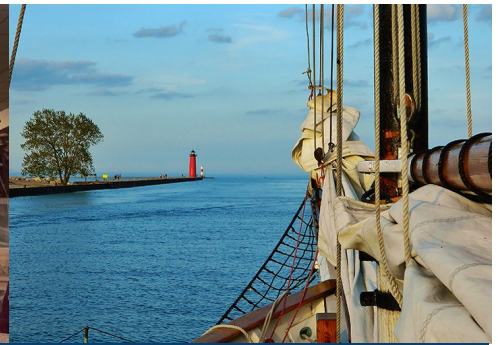
North Pier Lighthouse, Lake Michigan